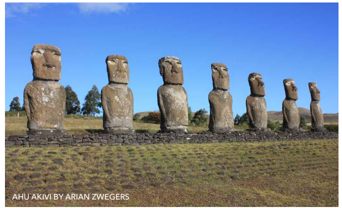
AHU AKIVI

After breakfast visit the Ahu Tahai, Sebastian Englert's Museum, Ahu Akivi, and Puna Pau Hill. Then drive to Rano Kau volcano, the biggest on the island, whose enormous crater is now a fresh water lake with floating green fields of totora reeds. Perched