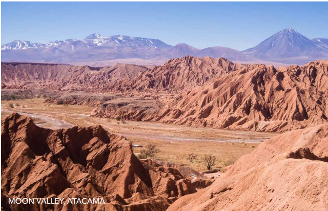
MOON VALLEY, ATACAMA

12th century under Inca rule. Next, travel to the Tulo Ruins, passing through the Cordillera de la Sal (Salt Mountains). Tulo, estimated to be more than 3,000 years old, is the oldest excavated village in the region. Return to San Pedro for a little rest time before heading back out in the late afternoon to visit Moon Valley and Death Valley. Moon Valley is one of the most visited places in San Pedro because of its dramatic stone and sand formations impacted by years of floods and winds. The valley also has dry lakes where salt composition covers the desert with a beautiful white mantle; escarpments of green, blue, red, and yellow surprise with their diverse and surprising forms, and the sun creates tones in thousands of different forms during the day, particularly in the twilight hours. At Death Valley, see rocky natural sculptures and sand dunes as far as the eyes can see. Enjoy stargazing – world-renowned in this region – before returning to the hotel. Overnight at Tierra Atacama. (BLD)