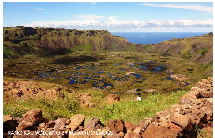
RANO KAU VOLCANO

above the lake on the crater wall is the ceremonial village of Orongo, where the bizarre "bird man" ritual took place. Partially restored, Orongo has 48 oval buildings built out of overlapping stone slabs. A rocky trail leads you to the Ana Kai Tangata cave; venturing inside, you see a few paintings relating to the bird man culture. In the afternoon, explore Ahu Vinapu, made up of two ruined Ahus (temple platforms), one of which has stonework remarkably similar to that found in Inca sites. Studies have supported the theory that the first inhabitants of the island came from the American continent. Continue to Rano Kao Volcano and Orongo. Observe petroglyphs of the "bird man" Tangata Manu, the god creator Make Make, and also Komari fertility symbols. From here, you can see views of three small islands, Motu Iti, Motu Nui and Moto Kao Kao, which play an important part in the "bird man" legends. Overnight at Explora Rapa Nui. (BLD)