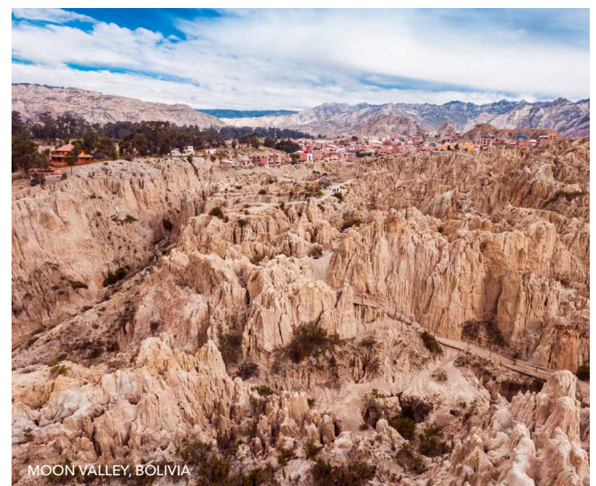
MOON VALLEY, BOLIVIA

Register online at holbrook.travel/cfc-boch22